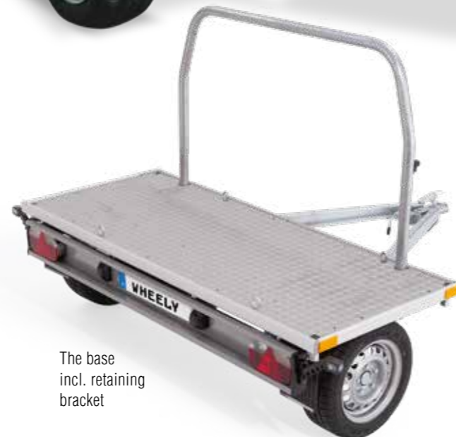
The base incl. retaining bracket

If the WHEELY is temporarily not in use, the tilting function allows it to be stored in a space-saving 2 m 2 area.