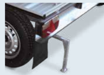
Rear supports – so that you can safely load your TRAIGO 500.