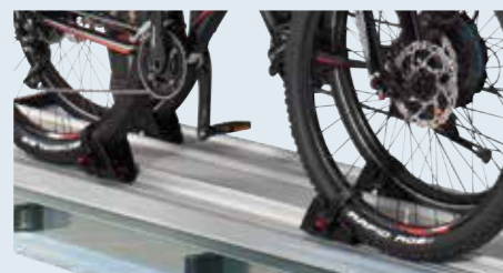
Wheel chocks with quick-release ratchet for bicycles.