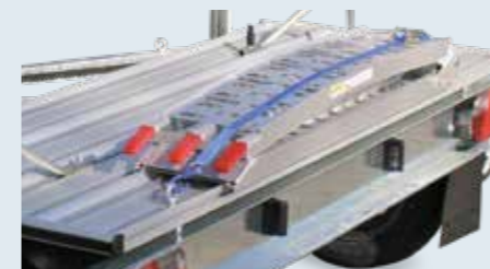
Folding ramp. Up to 340 kg load.