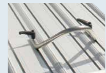
Infinitely adjustable wheel chocks for scooter.